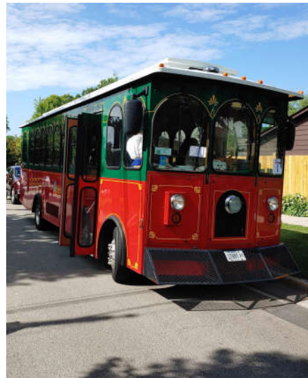
With the length of the parade, a trolley backed up our Veterans that had difficulty getting through the whole route.