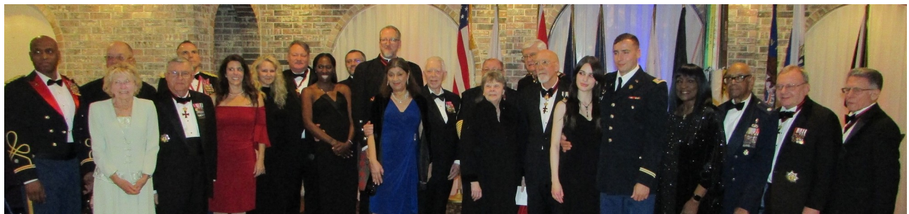
Medals on Display at the Veterans Ball

Mini-Convention at Evergreen Park post #854 at 8:00am